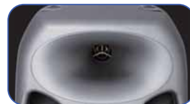
Proprietary 90° x 60° Elliptical Wave Guide™ horn design.

Our unique EWG™ design is the result of intensive computer modeling of natural acoustic wave propagation. To provide more acoustically transparent high-frequency pattern control, hard edges, corners, and parallel surfaces were eliminated from the design while still enabling 90 x 60 degree high frequency coverage. The smoother, more "organic" shape of the EWG™ design reduces high frequency distortion and diffraction eliminating acoustic artifacts found in other horn design technologies. The result is smoother frequency response, greater driver efficiency, and improved vocal and instrument reproduction.