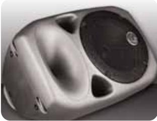
Designed to work as a floor monitor too

A top stacking feature is provided for multi-loudspeaker applications and the Titan™ Series can be used on its side as a stage monitor. The speaker stand receptacle features a locking screw to ensure stability and rubber-padded carry handles make the job of transporting the enclosure easier than ever.