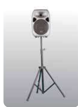
Integral stand mount for optional stands