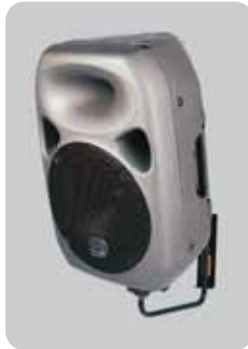
Optional wall-mount bracket for installation