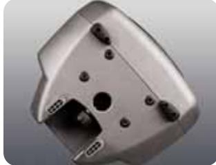
Trapezoid shape for arrays as well as stage monitor applications