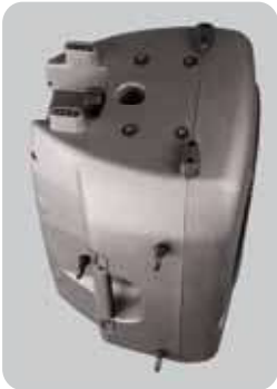
Rigging inserts for several hand-mount options

The bottom of the Titan™ Series provides a convenient built in pole mount socket that is used for easy mounting on a standard 35mm diameter speaker stand pole. Cord wrap and cable anchor features are also moulded into the enclosure. M6, M8 or M10 threaded rigging points are provided for a variety of safe flying configurations with four of these inserts available, bottom-mounted, in an OmniMount® 30.0 bracket footprint ( Titan™ 8) or in an OmniMount® 60.0 bracket footprint ( Titan™ 12 & 15).