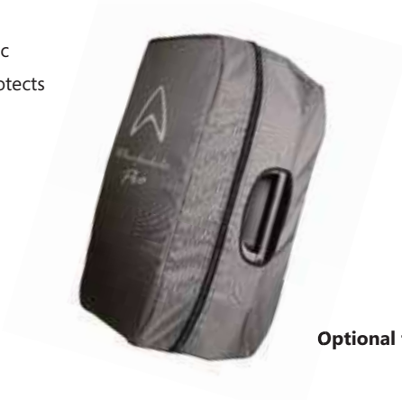
Optional travel bag

Titan™ TOUR BAG – Ballistic nylon zippered carry bag protects your Titan™ and features a storage pocket for cables.