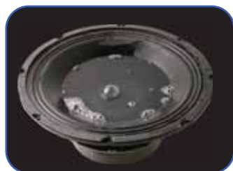
Moisture-proof low frequency driver for wherever you play.

The Titan™ Active Series features a custom designed, heavy-duty low frequency driver precisely matched to a high frequency Titanium compression driver with integral bi-amplification. Both drivers are designed for maximum output, wide dispersion and precise audio signal reproduction.