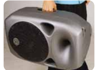
Ultra-light weight for maximum portability